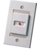
RA400Z Remote Annunciator (UL S2522)