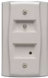
RTS151 UL S4011

System Sensor provides system flexibility with a variety of accessories, including two remote test stations and several different means of visible and audible system annunciation. As with our duct smoke detectors, all duct smoke detector accessories are UL listed.