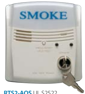
RTS2-AOS UL S2522