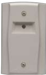
RA100Z UL S2522