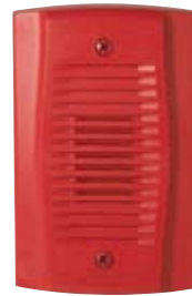
MHR UL S4011