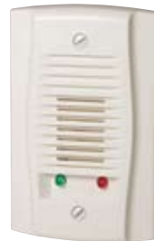
APA151 UL S4011