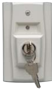
RTS151KEY UL S2522