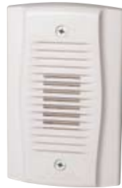
MHW UL S4011