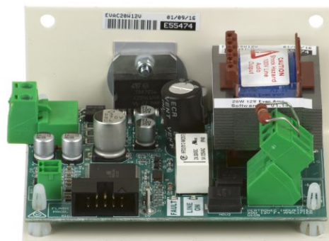
Pertronic 20W, 12V Amplifier EVAC20W12V