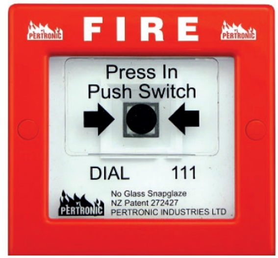
Analogue Addressable Weatherproof Manual Call-Point