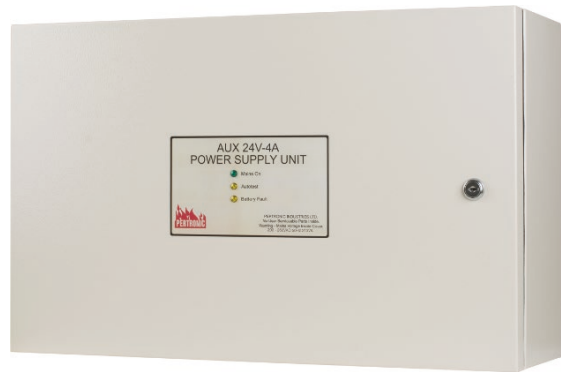
Pertronic Auxiliary 24V, 4A Power Supply (AUX24/4PSU)

Pertronic Power Supplies are supplied without batteries. The battery calculator on the Pertronic website may be used to work out the system current and the size of battery needed for a particular application.