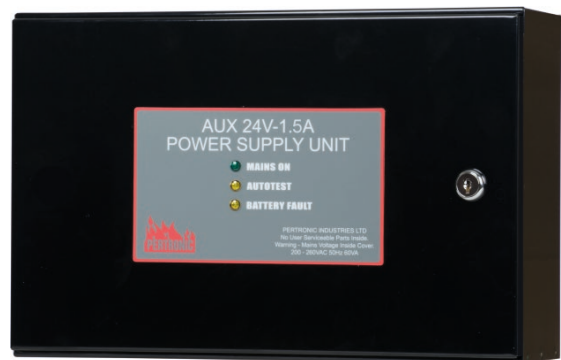
Pertronic 24 Volt 1.5 Amp Auxiliary Power Supply in Lockable Battery Cabinet (AUX24V-1.5PSU-BLK)