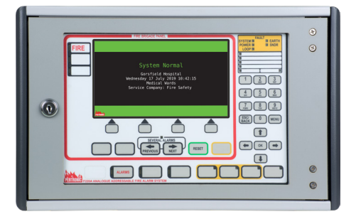
F220 Full Function Mimic / Net2 Network Control Unit