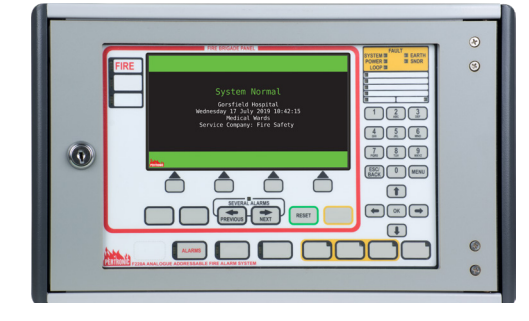
Pertronic F220 Full Function Mimic. When fitted with Net2 network firmware, this unit becomes the Pertronic Net2 Network Control Unit

When used as F220 panel mimics, these units display information from the connected panel only. When used as Net2 network mimics, they can be programmed (In FireUtils®) to display information from selected panels, or from the entire network. In addition, the Net2 Enhanced Mini-Mimic and the Net2 Alarm Mini-Mimic can be programmed to monitor specific zones.