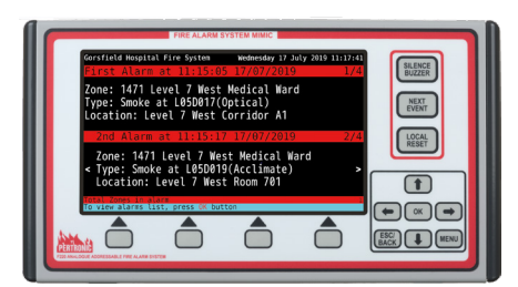
F220 Alarm View displayed on an F220 Enhanced Mini-Mimic

The F220 and Net2 Enhanced Mini-Mimics are capable of accessing all system event information, including faults (defects), pre-alarms, and disablements (isolations).