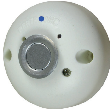
Pertronic Encapsulated Indicating Heat Detector, Alkaline Resistant

The detector is available in two temperature ranges (Blue: 57 °C and Yellow: 77 °C).