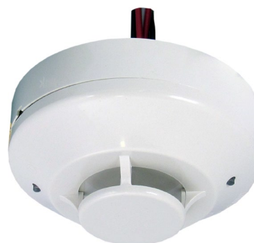
Analogue Addressable Weatherproof Heat Detector Types 5251B-WP and 5251RB-WP