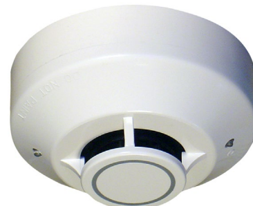
Analogue Addressable Indoor Heat Detector Types 5251BPI and 5251RBPI

The fire panel may be configured to briefly light up the LEDs ("blink") when each detector is polled.