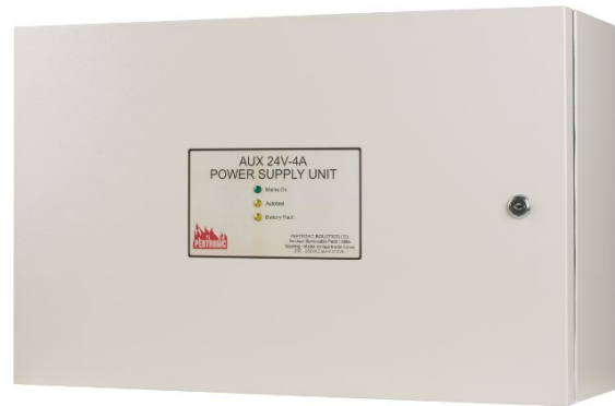
Pertronic Auxiliary 24V, 4A Power Supply (AUX24/4PSU)