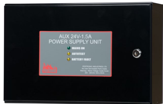
Pertronic 24 Volt 1.5 Amp Auxiliary Power Supply in Lockable Battery Cabinet (AUX24V-1.5PSU-BLK)