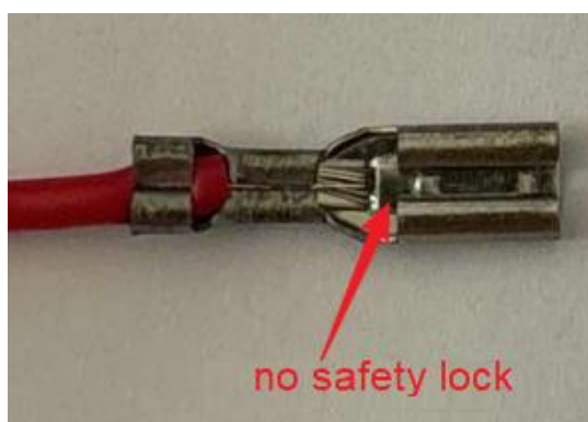
A tap connector with no safety spring lock

The tap connector is fitted with a safety spring lock to eliminate the risk of disconnection while in service.