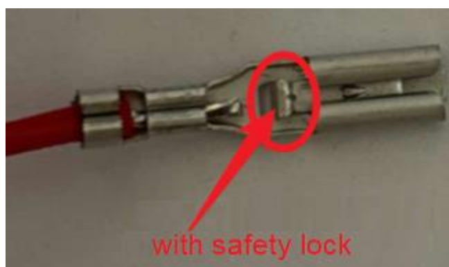
Supplied tap connector with safety spring lock

Squeeze the spring lock with needle-nose pliers, and gently pull to unplug the connector. Alternatively the connector insulation may be slid back onto the wire, out of the way, to provide better access to the spring lock. Remember to push the insulation back after the terminal has been disconnected.